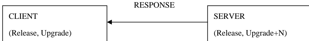
Figure 3 Upgraded servers returning a response to legacy clients