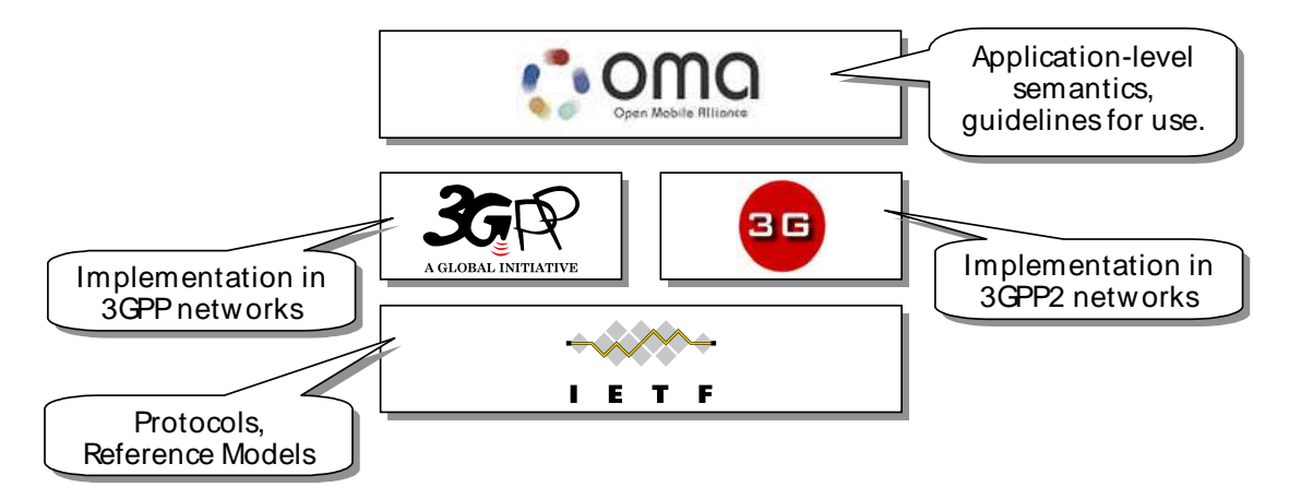
Figure 1. Presence specification layers

OMA's role is to create application level specifications for Presence Service. This includes Presence Information semantics and guidelines for presence applications (see Figure 1). These specifications shall be agnostic to the underlying network technology, be it specified by 3GPP, 3GPP2, or other organizations.